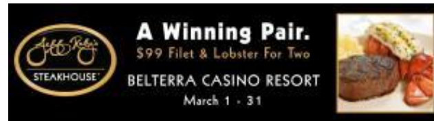
Keyword – “Steak & Lobster”