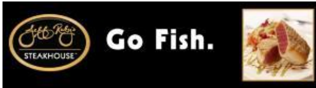
Keyword – “Tuna”