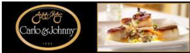
Keyword – “Scallops”