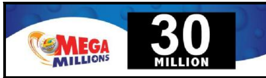
Triggered Ad (Jackpot > or = 30)