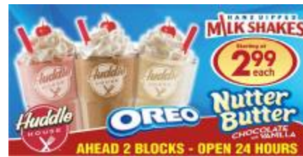
Hot Weather > 80 F