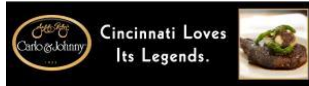
Keyword – “Steak”